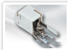
BONUS WALKING FOOT

Key Features Superior Utility Value (SUV) machines deliver solid, reliable performance. Choose between the 8 or 22 stitch model.