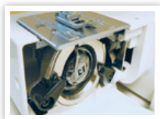
FRONT LOADING BOBBIN