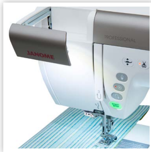
ENHANCED (1.6X BRIGHTER) FULL INTENSITY LIGHTING SYSTEM