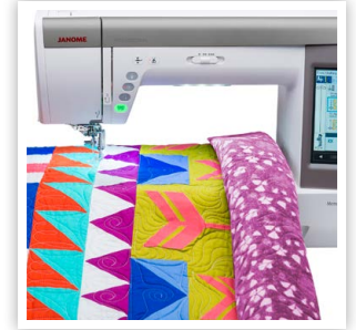
11" BED SPACE