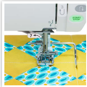
DETACHABLE ACUFEED™ FLEX FEATURING THE NEW HP2 FOOT