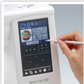
MULTI-LANGUAGE TOUCH SCREEN