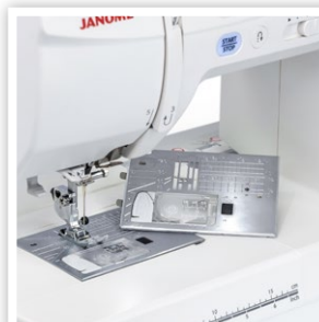
2 NEEDLE PLATES: ZIG ZAG, STRAIGHT STITCH