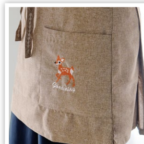
240 BUILT-IN EMBROIDERY DESIGNS