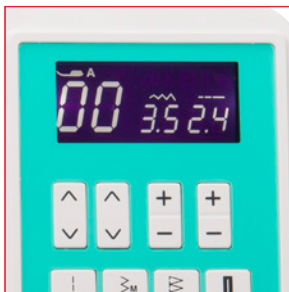
Backlit LCD Screen with 100 Built-in Stitch Options