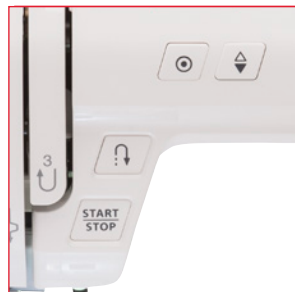
Easy Convenience Features