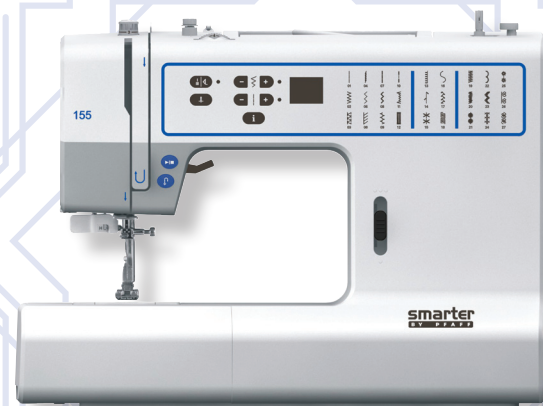
SMARTER BY PFAFF™ 155

Available for a limited time only! Get your PFAFF® Anniversary Machines today. Visit your local Authorized PFAFF® Dealer