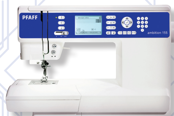
PFAFF® ambition ™ 155

In celebration of our PFAFF® loyal sewists, we have created two special edition computerized machines to celebrate these last 155 years of advancement and innovation in sewing. Whether you are an expert or novice looking to advance your sewing, you can enjoy the features of the PFAFF® ambition ™ 155 and the SMARTER BY PFAFF™ 155 computerized machines. Both offer affordable and best-in-class craftsmanship required by passionate creators who set the standards for today's sewing.