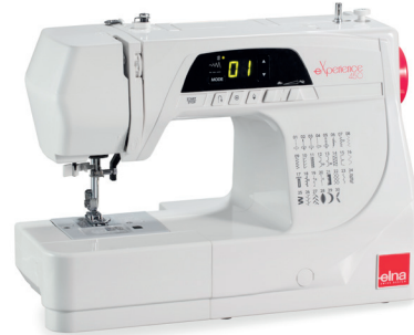
COMPUTERIZED SEWING MACHINE