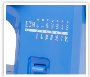
15 BUILT-IN STITCHES