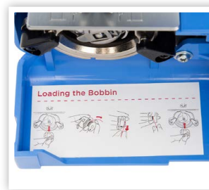
BOBBIN INSERTION GUIDE FOR EASY REFERENCE