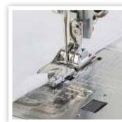
Rolled hem foot