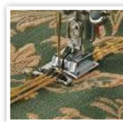
3-Way cording foot